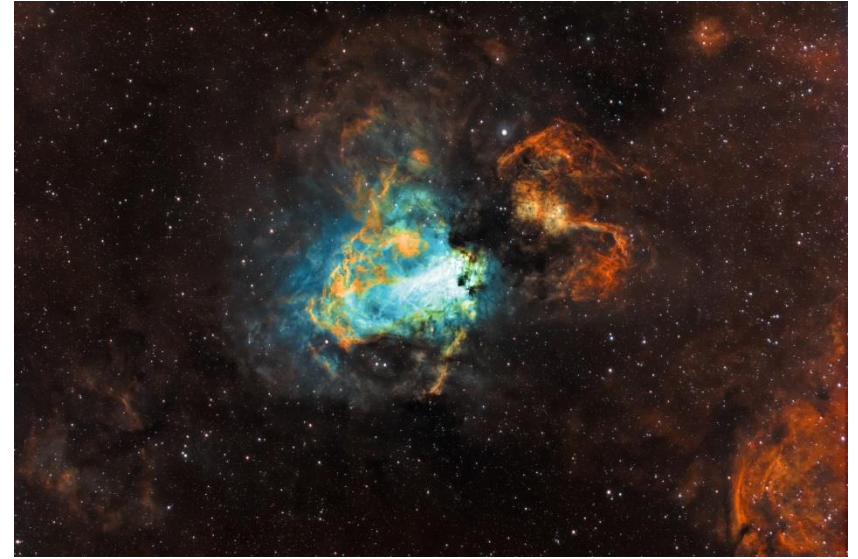
M17-SHO Hubble 3